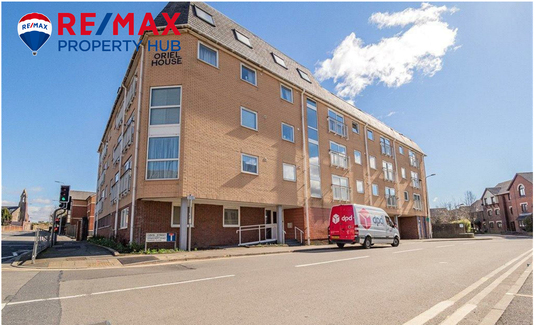
Oriel House, 12 Windsor Road, Cardiff, South Glamorgan, CF24 2FY £175,000