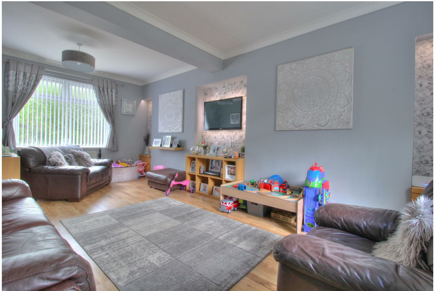
Hill View, Pontycymer, Bridgend, CF32