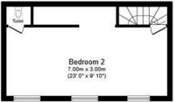
First Floor Floor area 27.4 m 2 (295 sq.ft.)