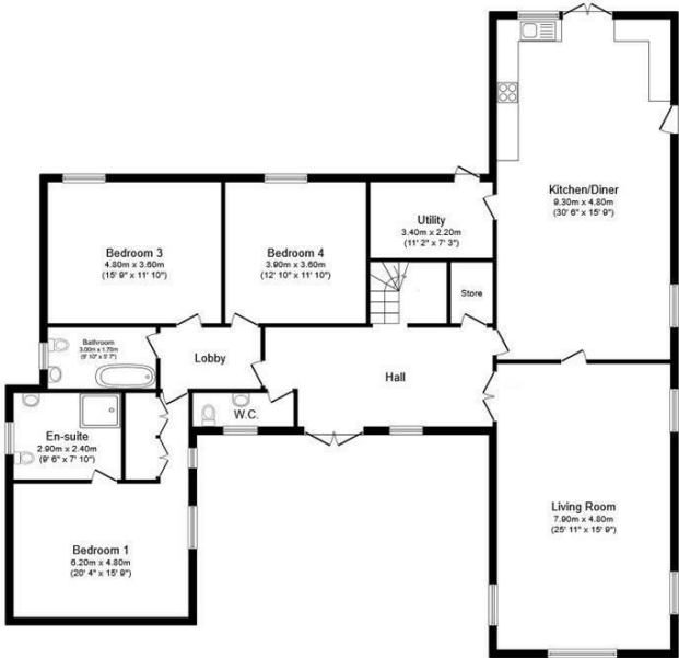
Ground Floor Floor area 193.6 m 2 (2,084 sq.ft.)