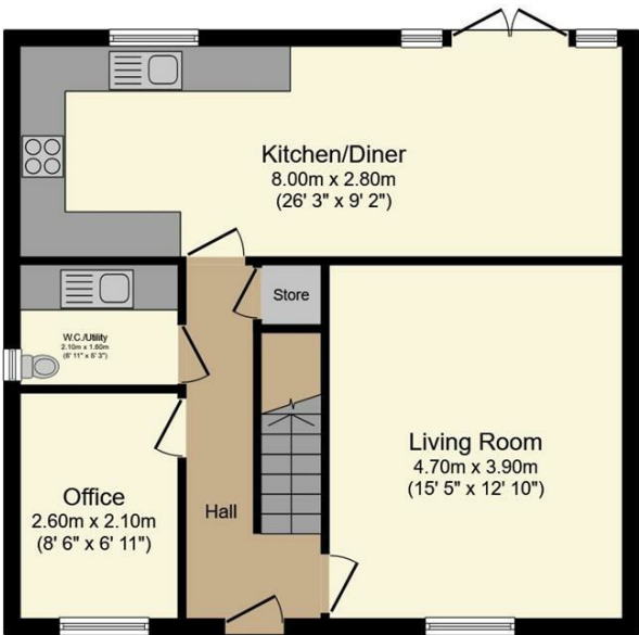
Ground Floor Floor area 60.8 sq.m. (654 sq.ft.)